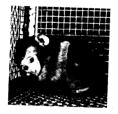
An isolated rhesus monkey. (From Kaplan and Sadock's Synopsis of Psychiatry, Eighth Edition. Reprinted with permission of Lippincott, Williams & Wilkins.)

The physiologic signature of the despair phase is that of widespread disruption of bodily rhythms. Heart rate will be low, and on the electrocardiogram we will find abnormal, serrated beats in-